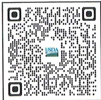
Home Repair Program Webpage