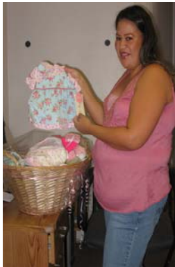
39 th Baby Basket donated by The Westmorland Presbyterian Church