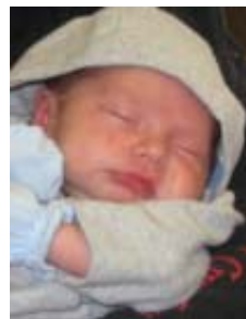
40 th Baby Basket donated by Westmorland Presbyterian Church