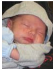
40 th Baby Basket donated by Westmorland Presbyterian Church